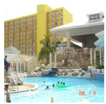
The Sunset Jamaica Grande

ion. The most popular reason why it was enjoyable was "It was good to see everyone". Most of you stated that the length of the reunion "was just right". The excursion to Dunn's River Falls came in as favorite activity with the family banquet a close second. The beach Olympics and Memorial received honorable mention. Most of us agreed the "all inclusive" way was the way to go and suggested hosting future reunions in the "summertime" or "July". Even though the hotel was still under major renovations and some of the staff was a little inexperienced, we still made the amenities work for us. Many of the surveys mentioned "making the reunion more affordable" as the one thing we need to change. Some suggested that we con-