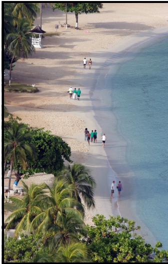
Uncle Ruddy capturing the family beach walk in 2007 from his hotel room

“In every conceivable way, family is the link to our past, bridge to our future.”