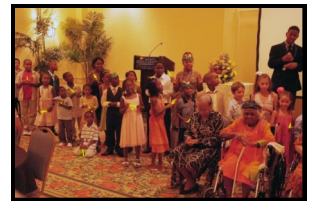
Kids gather to celebrate the family matriarchs in 2007

case. Step up to the mic and belt out your favorite tune or poem for a chance to win a prize. Past Reunion winners received an iPod and this year's prize is even better. A prize will be awarded in a youth and adult category. This is your opportunity to shine or simply have some great fun!