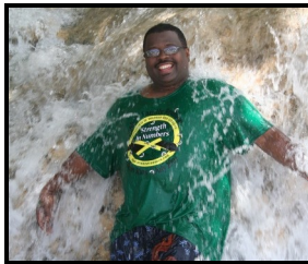
Fitzroy cooling off at Dunn's River Falls — July 2007

8:00 AM Breakfast Grab a bite at the Grande Palm then meet in the lobby.