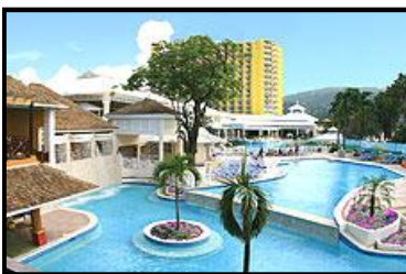
One of the many pools at the All Inclusive resort, Sunset Jamaica Grande.

In closing, “Getting Stronger” is such a simple yet appropriate theme as we have all become closer and have developed stronger relationships. As we move to put all of our ideas in motion to propel our family, we have all certainly gotten stronger.