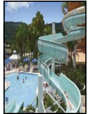
Kids enjoying the slide at the Sunset Jamaica Grande.

We are extremely pleased we have a venue that is willing to offer our family such generous concessions as our final choice is obviously the Jamaica Grande. The Committee is ecstatic about the biggest reunion yet and we are working diligently to make certain that your reunion experience will offer you something new, educational and unforgettable.