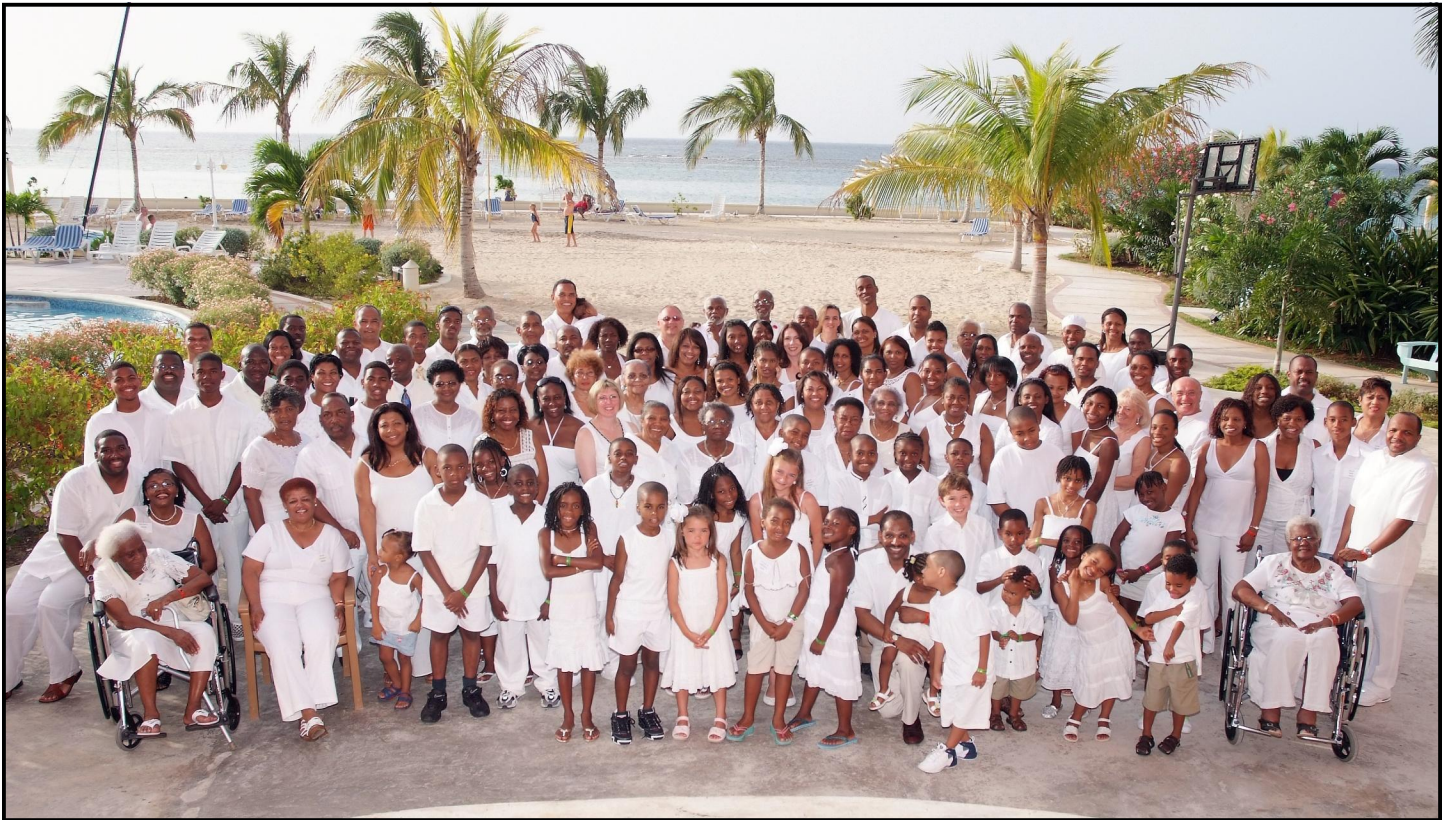
Family photo taken by Ruddy Hibbert - "Strength in Numbers" 2007