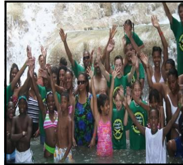
Family members enjoying the cool waters of Dunn's River during the 2007 reunion.

ing to provide an advanced comprehension of our name-sake with the goal that we will give each family member more than just the ability to say that we are from Jamaica, but give