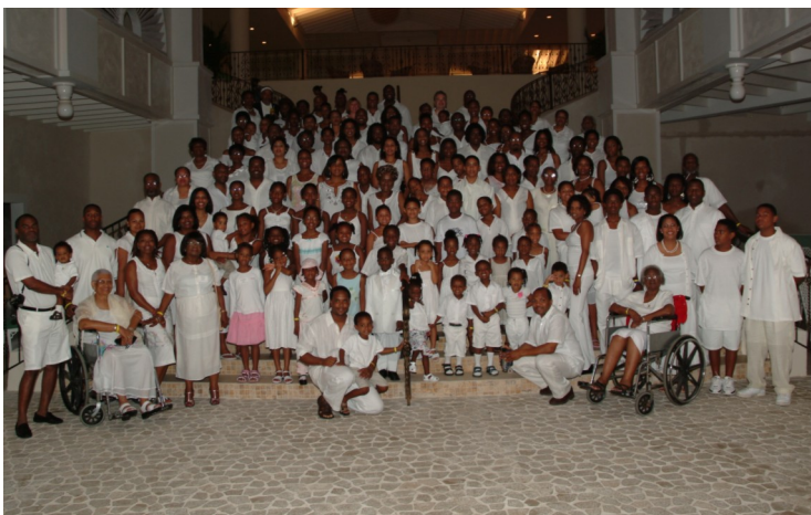
Family Portrait at the inaugural Hibbert Family Reunion dubbed "Know Your Roots".