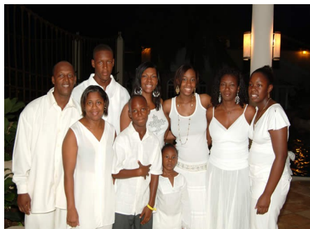
A few "Munoz" descendants posing at the 2005 "White Party".