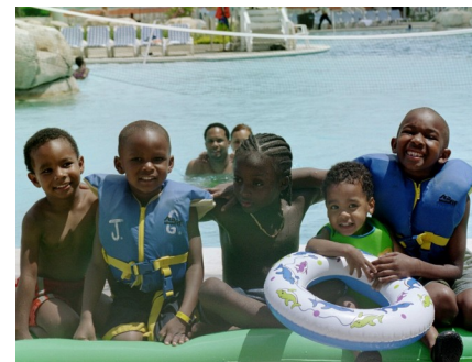
Kids having fun in the pool at the 2005 Reunion.