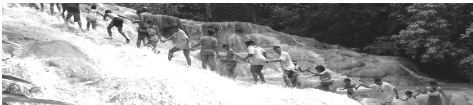
2005 Reunion attendees climbing Dunns River Falls.