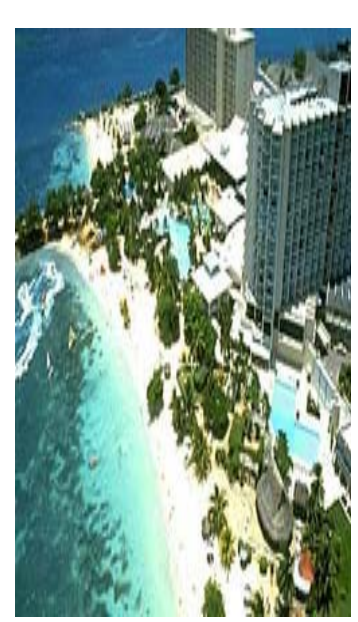
Sunset Jamaica Grande Hotel and Resort

Greet on Wednesday everyone will be issued a team color (White, Red, Green or Yellow). Please remember your color because while you participate in events you will be scoring points for your team. Good Luck! Also at the Meet and Greet you will receive a reunion survey. Please complete the survey by Sunday and leave it with a committee member. The reunion committee thanks you for your attendance at this inaugural event. Please take this time to introduce yourself to members of the family that you may not know. Hopefully we can take away from this event the power of unity and a sense of family pride.